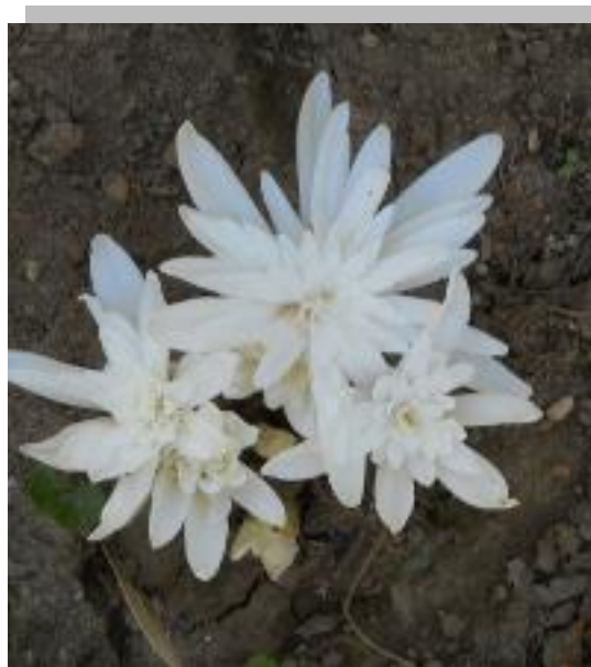
White Colchicum Double Variety