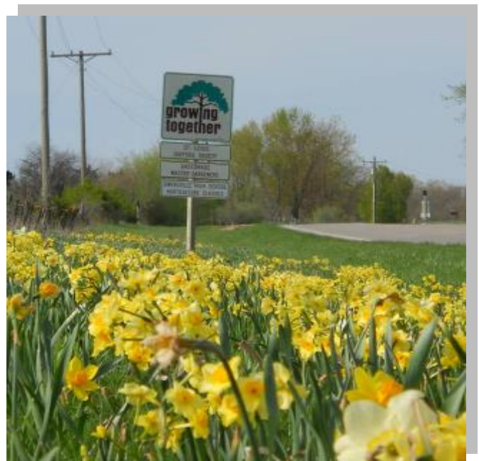
Along HWY 19 in Gasconade County