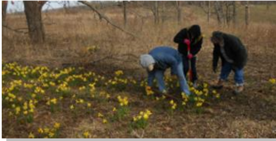
Digging 'February Gold' at SNR on April 2, 2013