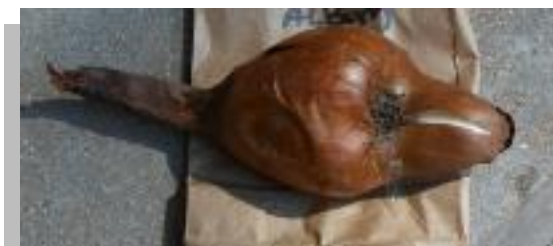
Little "clam" foot on the right