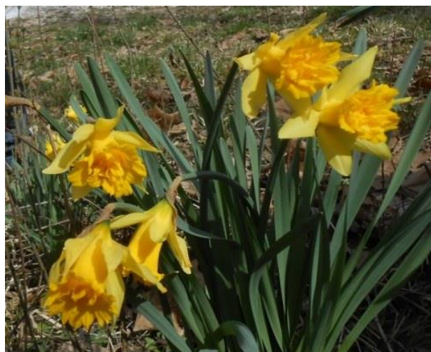
True 'Van Sion' found at SNR for a lucky few

"In 1629, Parkinson called gardeners ignorant who called some daffodils 'narcissus', as "we" all know that the Latin 'narcissus', is 'daffodil' in English. Parkinson divided daffodils into narcissus , and named them 'true daffodils', and pseudonarcissus , the 'bastard daffodils'. Narcissus pseudonarcissus , the bastard daffodil, was so called because the petals were longer than the cup. At that time, true daffodils were thought to be flat faced, or short cupped such as the n. Poeticus which was popular at the time."