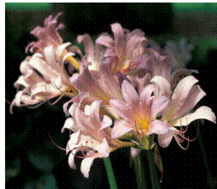
Lycoris squamigera , the ubiquitous pink

For years, only four varieties were readily available in commerce. Of these, two are subtropical species not hardy in our climate ( L. x albiflora , L. aurea ); another, viably hardy but only marginally 'bloom' hardy ( L. radiata ); and the last, albeit hardy and floriferous, is as common as dirt ( L. squamigera ).